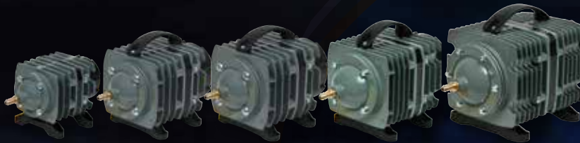
EOCP254 EOCP258 EOCP272 EOCP274 EOCP284