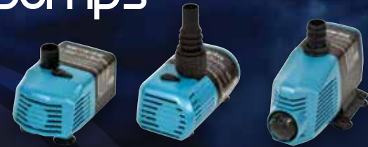
EHP204 EHP216 EHP240